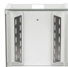
Antistatic ionizer built into the weighing chamber