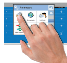
Intuitive operation and touch screen