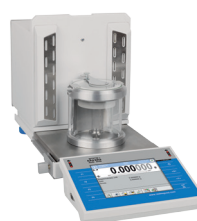
XA4Y.M.A.P balance operating without anti-draft chamber