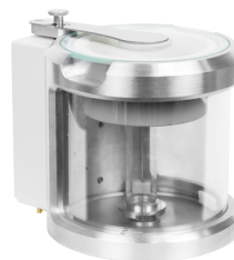
Automatic pipettes calibration adapter with an evaporation ring